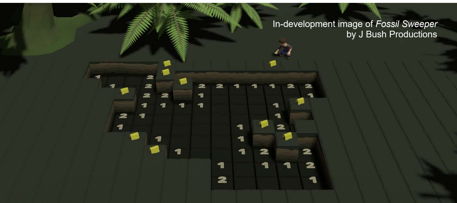
In-development image of Fossil Sweeper by J Bush Productions

Priority will be given to projects that have marketplace attachment or financial support from other screen agencies.