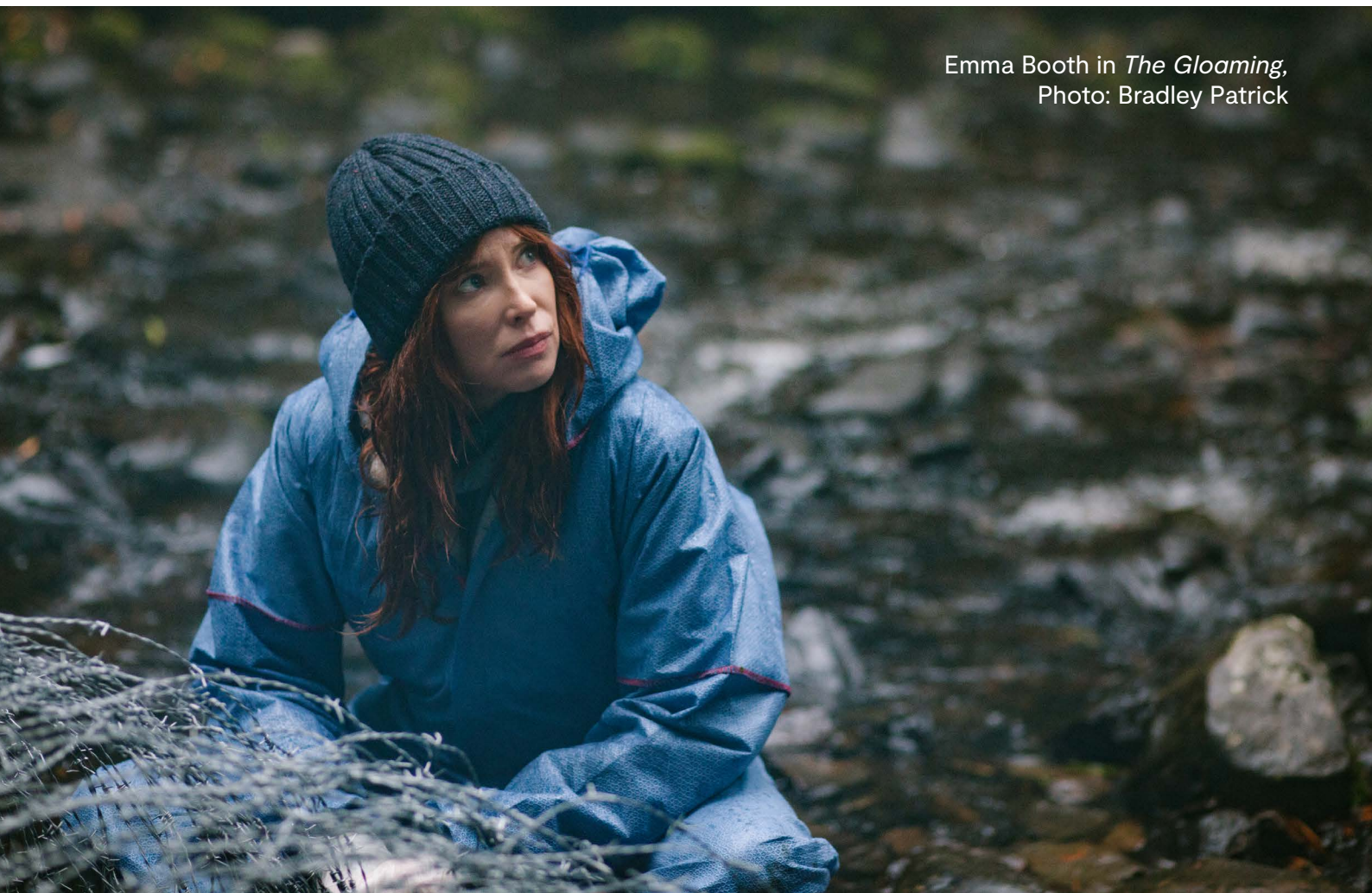
Emma Booth in The Gloaming

Funding for other (non-mandatory) attachment