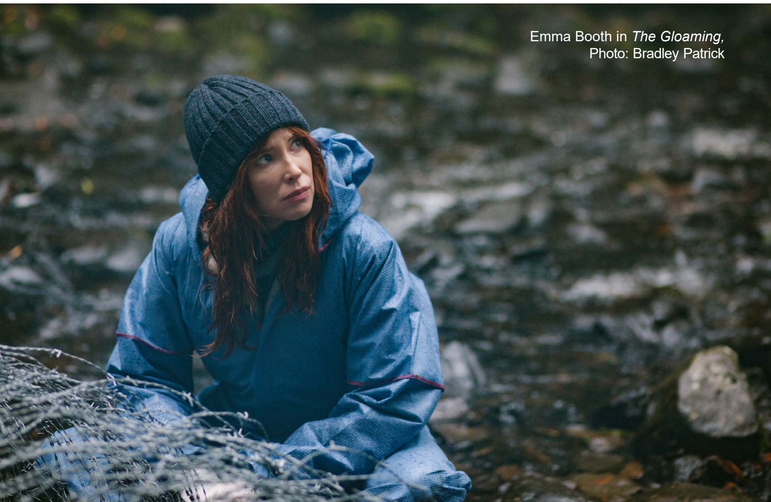
Emma Booth in The Gloaming

Funding for other (non-mandatory) attachment