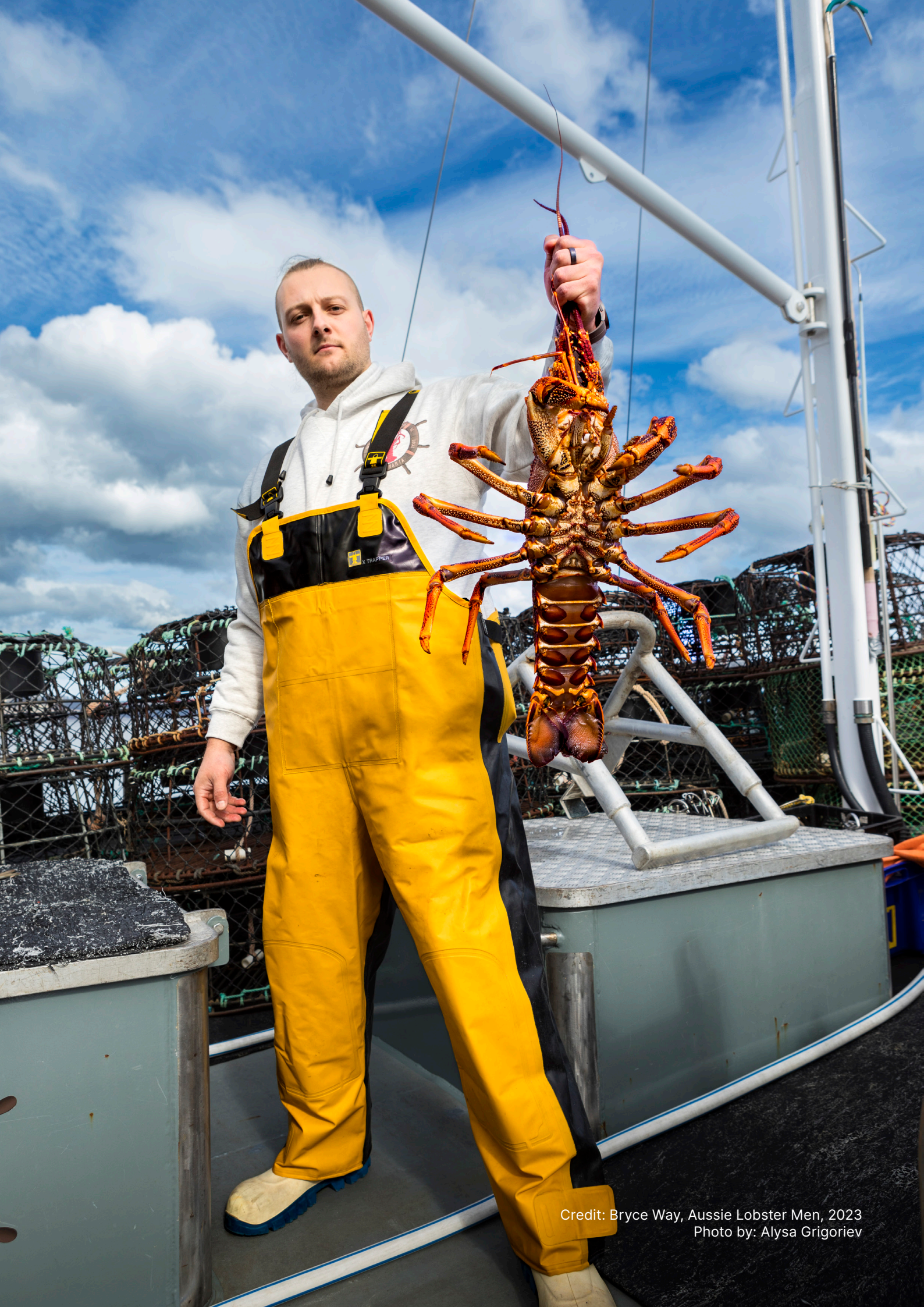
Credit: Bryce Way, Aussie Lobster Men, 2023 Photo by: Alysa Grigoriev